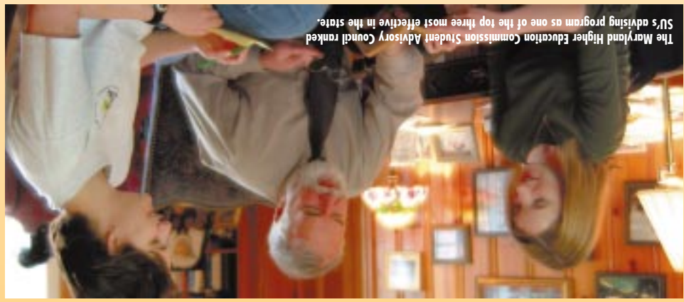
The Maryland Higher Education Commission Student Advisory Council ranked SU's advising program as one of the top three most effective in the state.