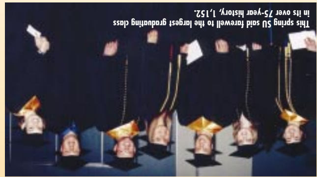
This spring SU said farewell to the largest graduating class in its over 75-year history, 1,152.