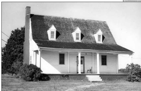
7 Memoirs of a Farm House