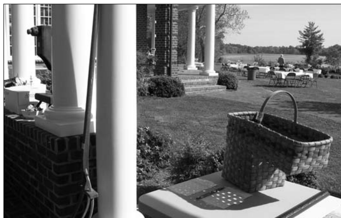
4 Bordeleau – ‘A Fantastic Day’