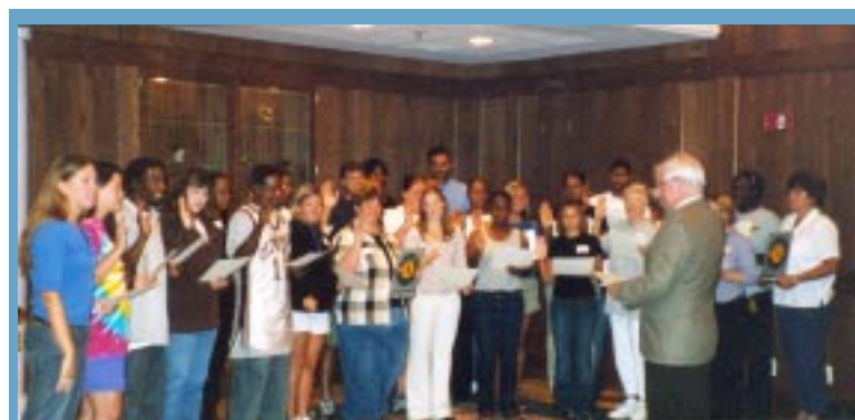
AmeriCorps Members 2003-2004