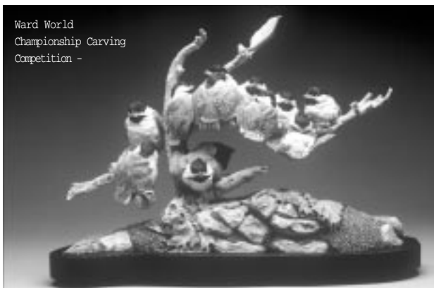
Ward World Championship Carving Competition -