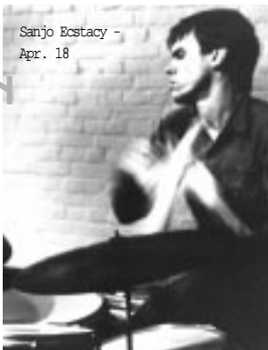
Sanjo Ecstasy - Apr. 18

Breakfast with Federal Reserve Bank President 410-543-6316 to register Hyatt Regency Chesapeake Bay Golf Resort, Cambridge, MD, 7:30 a.m.