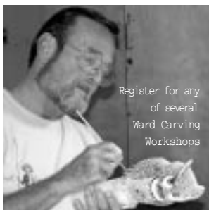
Register for any of several Ward Carving Workshops

$252 Ward members 410-742-4988, Ext. 110, to register Ward Museum