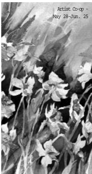
Artist Co-op - May 28-Jun. 25

CONCERT: Salisbury Symphony Orchestra Spring Concert Cost: $15 adults/$10 SU ID & seniors/$5 children 15 and under Holloway Hall Auditorium, 2 p.m.