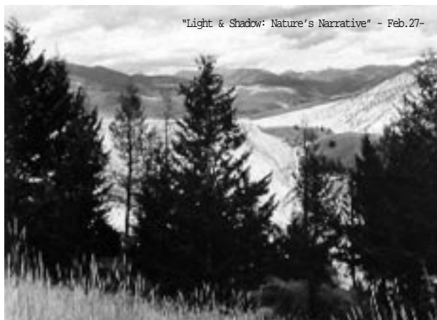
"Light & Shadow: Nature's Narrative" - Feb. 27-