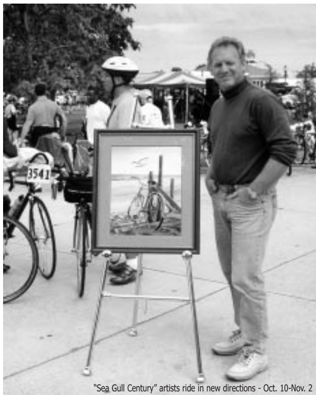
"Sea Gull Century" artists ride in new directions - Oct. 10-Nov. 2