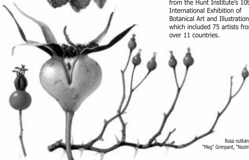
Rosa nutkana, "Meg" Grimpan, "Nozimi"