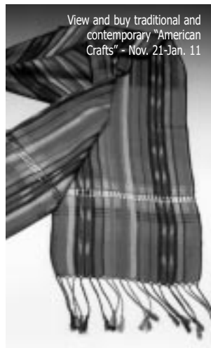
View and buy traditional and contemporary "American Crafts" - Nov. 21-Jan. 11