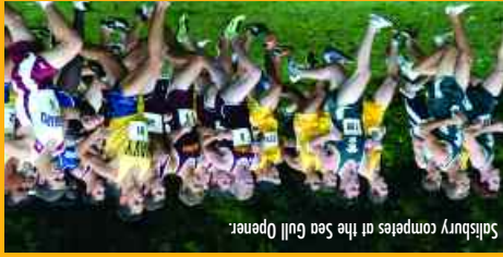
Salisbury competes at the Sea Gull Opener.