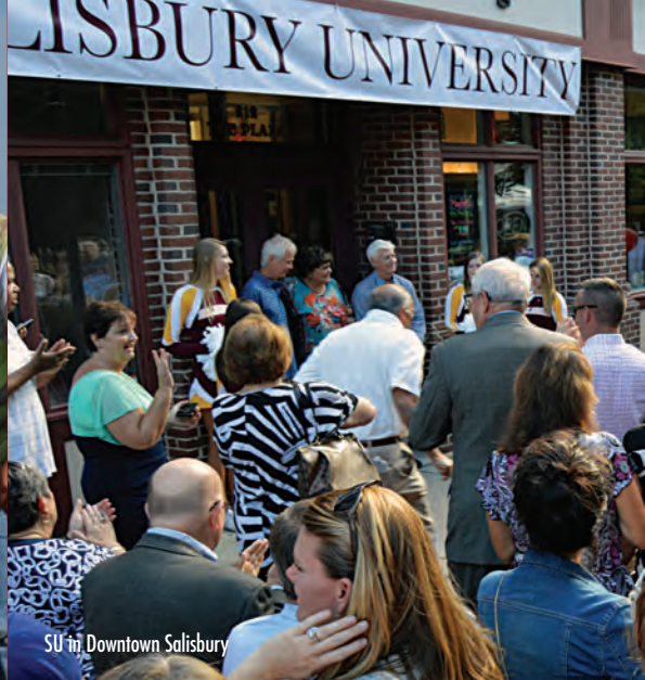
SU in Downtown Salisbury