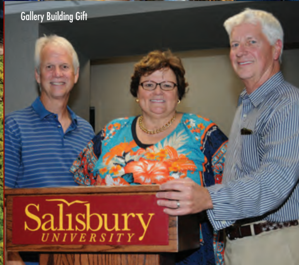
Gallery Building Gift