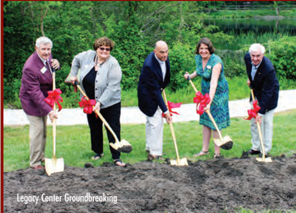
Legacy Center Groundbreaking