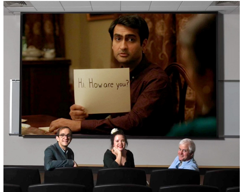
Join the Film Program faculty in the newly refurbished Herman Van Apeldoorn Film Center at Fulton Hall