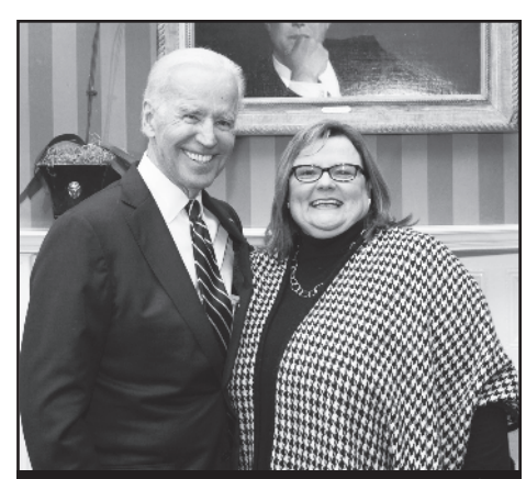
With U.S. Senator Joe Biden, Fall 2000 Commencement speaker (and future U.S. vice president)