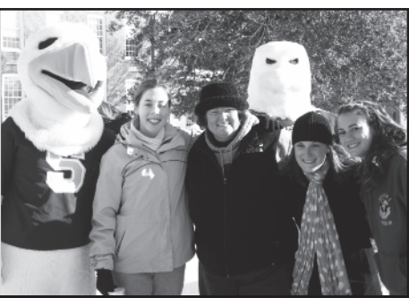
Following "Snowmageddon" in 2010, the President joined students to create a Sammy the Sea Gull snowman on Holloway Hall Lawn.