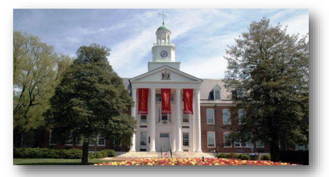
Salisbury University has a strong institutional commitment to diversity and is an Affirmative Action employer, providing equal employment and educational opportunities to all those qualified, without regard age, class, citizenship, color, disability ethnicity, gender, genetic information, immigration status, national origin, race, religion, sexual orientation, and veteran status.