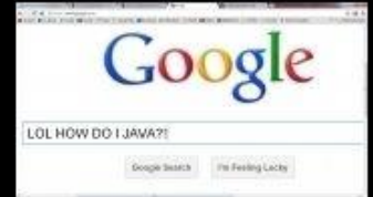
What I actually do.