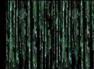
What I think I do.