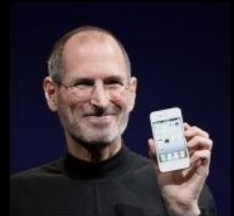
What society thinks I do.