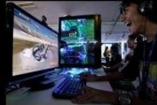
What my professor thinks I do in class.