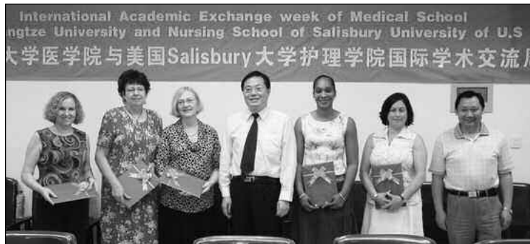
SU faculty at Yangtze University, Jingzhou, China

Both of these programs include credit bearing nursing courses of various amounts. Please contact the faculty members for specific details.