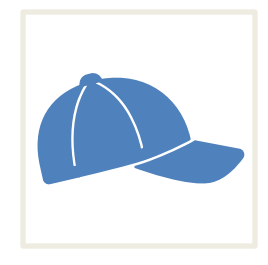
Can wear marketing items such as logo wear, shirts, hats, pins