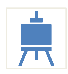
Video graphics, posters, etc. allowed in your PowerPoint Presentation. Just don't let it be distracting