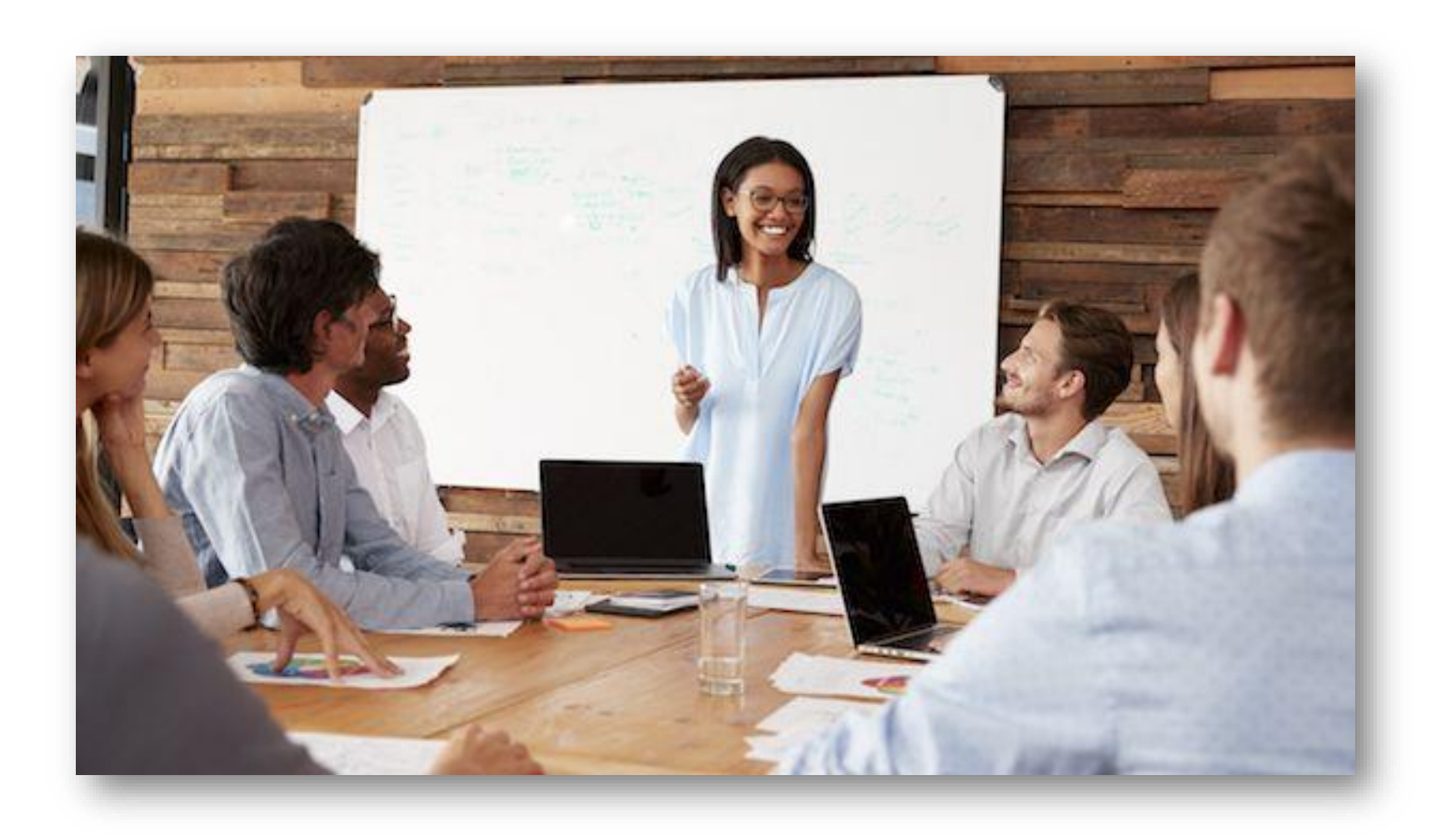
Share your 1-minute pitch