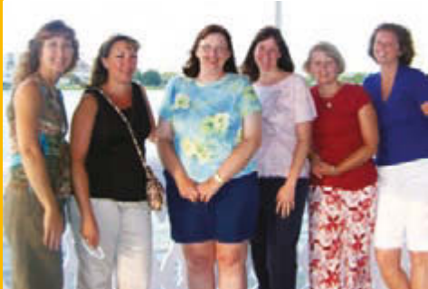
Ladies of 1988 Class Reunion