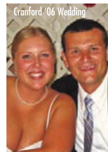
Cranford '06 Wedding