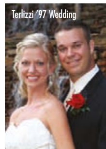
Terlizzi '97 Wedding