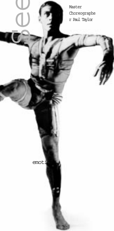
Master Choreographer Paul Taylor

Choreographer Paul Taylor, hailed by "Time" as "the reigning master of modern dance," established Taylor II in 1993 to ensure that his works could be seen by audiences all over the world, unhindered by economic or logistical limitations. In selecting repertory for the company, Taylor chooses dances that span the broad spectrum of his work and introduce athleticism, humor and a range of