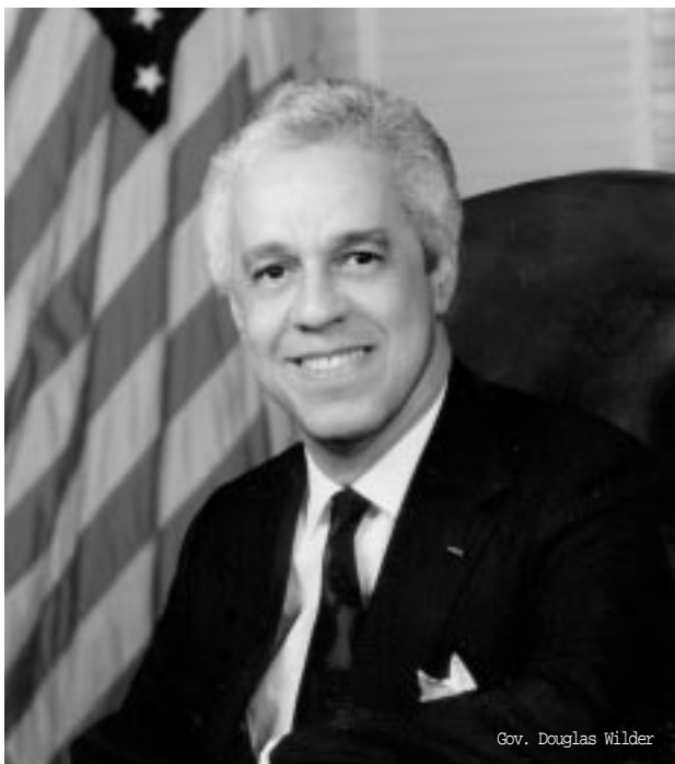
Gov. Douglas Wilder