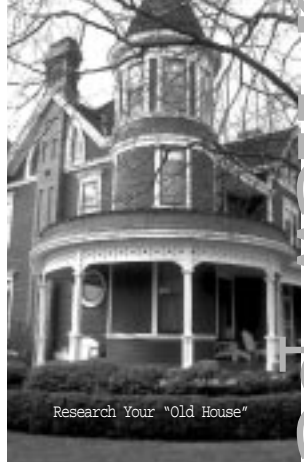
Research Your "Old House"