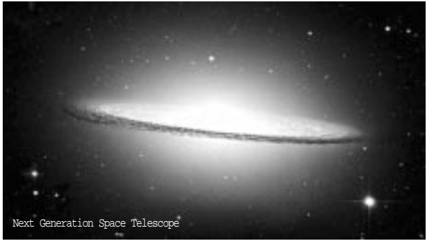
Next Generation Space Telescope