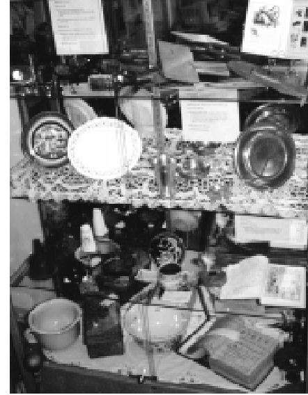
The Stuff of Colonial Inventories