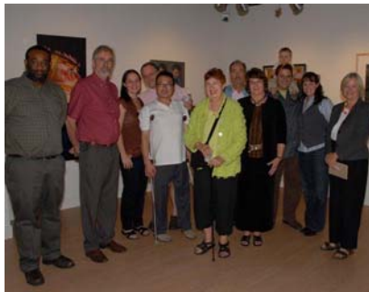
Art faculty at opening reception of the annual Art Faculty Show on October 5 at Montgomery College