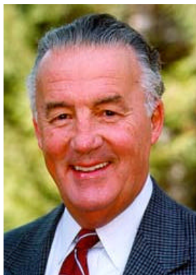
Senator Paul Sarbanes (MD)

Before making formal remarks on "The Crisis in Corporate America," Senator Sarbanes, who is a Salisbury native made good (indeed!), heaped praise on what he had found on this, his most recent visit to campus. He celebrated an academic community alive with intellectual vitality and enterprise; he noted, in particular, the series of events devoted to Hispanic culture, including the literary readings from the works of Latin America's Nobel Lau-