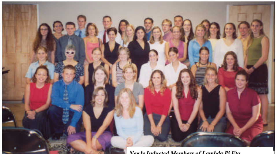
Newly Inducted Members of Lambda Pi Eta