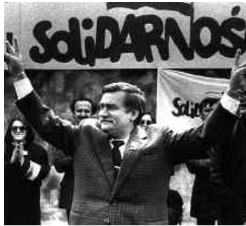
Polish President Lech Walesa, 2006 One Person Can Make a Difference lecture series speaker

Dr. Gandhi's presence on Salisbury's campus provides students a once-in-a-lifetime opportunity to meet, listen to and speak with a