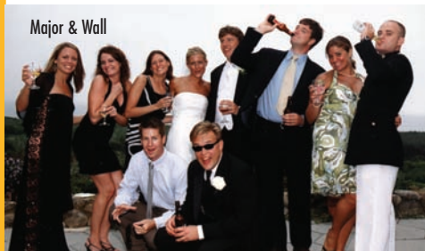
Major & Wall