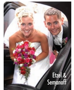
Etzel & Semanoff