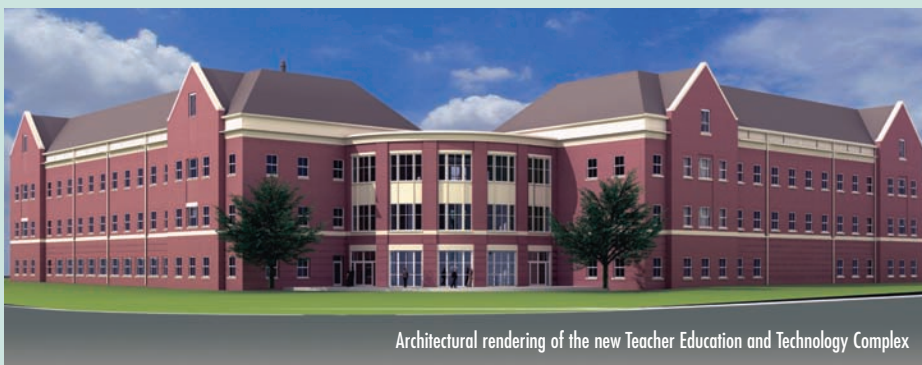
Architectural rendering of the new Teacher Education and Technology Complex