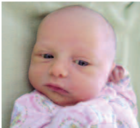
Cancelliere - Greaves