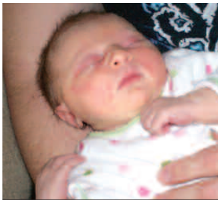
Lucas - Perro