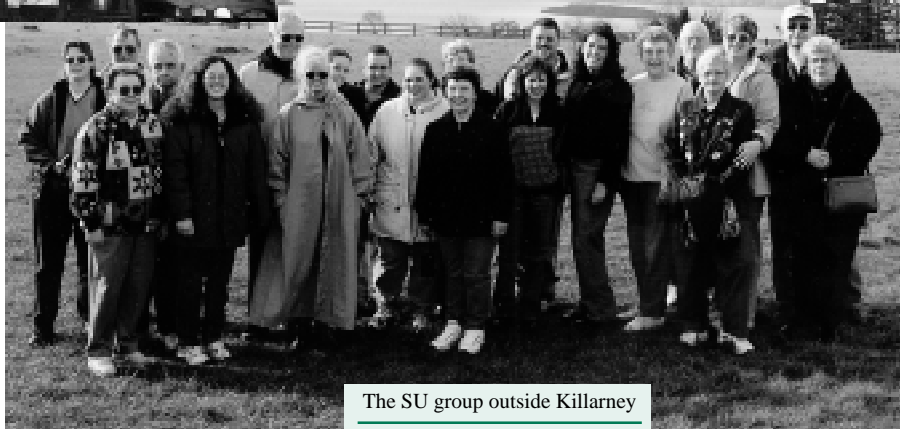
The SU group outside Killarney