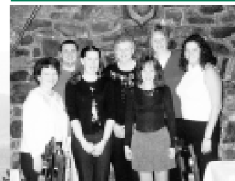
Inside Barberstown Castle, outside Dublin (formerly owned by Eric Clapton)