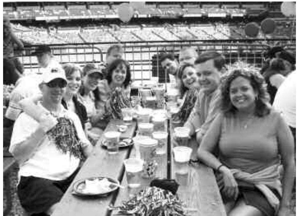
Baltimore Chapter members attend a picnic prior to an Orioles game.