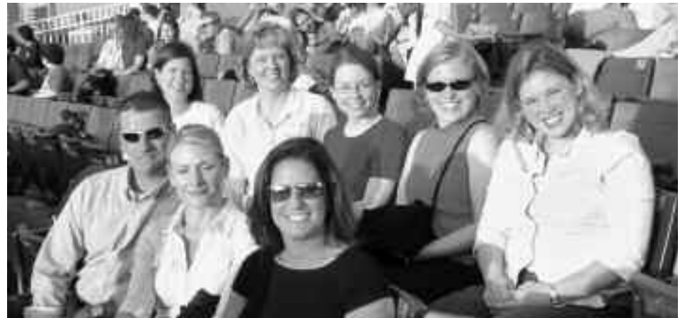
Northern Delaware Chapter members enjoy a Wilmington Blue Rocks game.