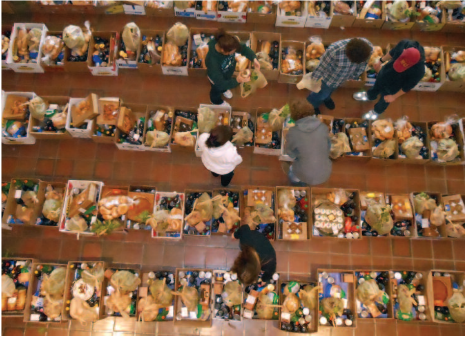
Presidential Citizen Scholars filling boxes for the Thanksgiving Food Drive.