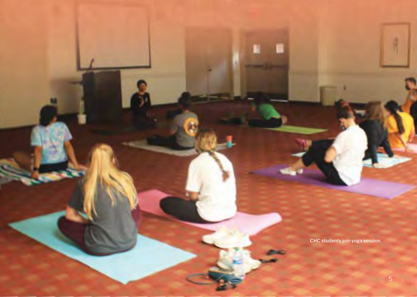
CHC students join yoga session.

The CHC Mental Health Committee can be found @chcmentalhealth on Instagram, and they are always looking for more students to join them in their mission.