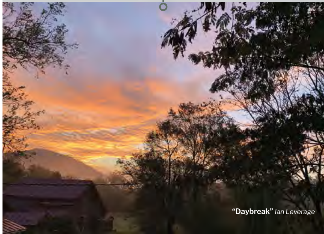
"Daybreak" Ian Leverage