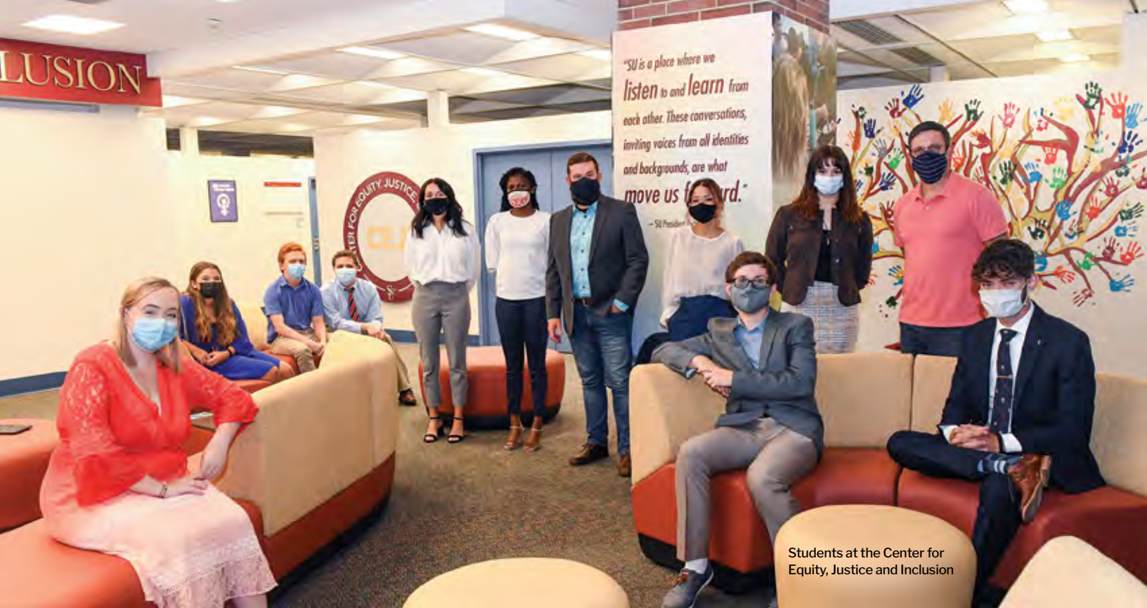
Students at the Center for Equity, Justice and Inclusion