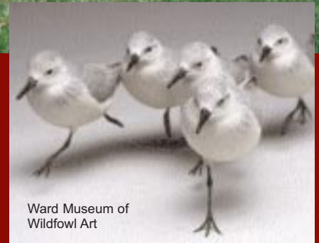
Ward Museum of Wildfowl Art