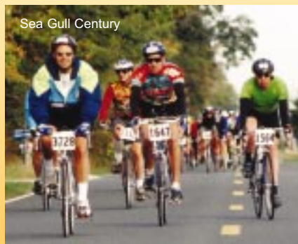
Sea Gull Century