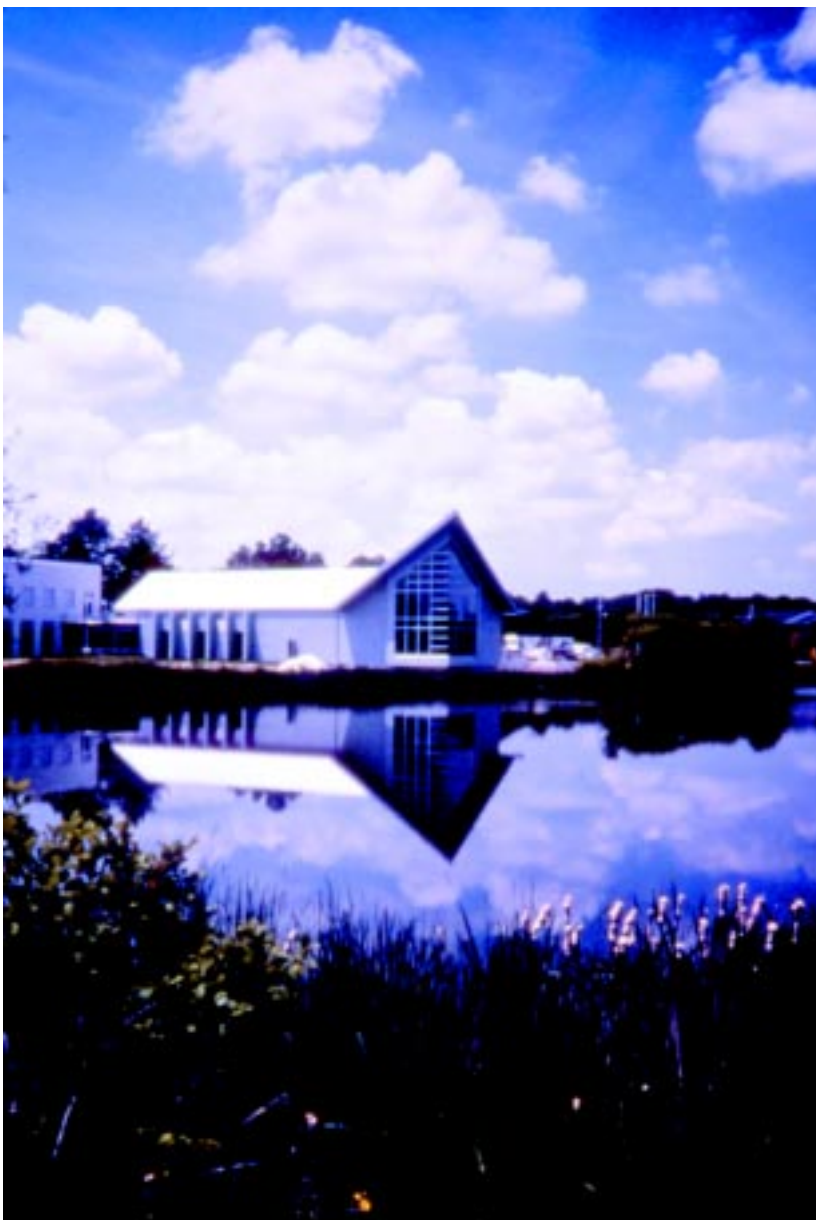
Ward Museum of Wildfowl Art

The museum established an aggressive development program with an emphasis placed upon endowment, planned giving, membership and operational income.