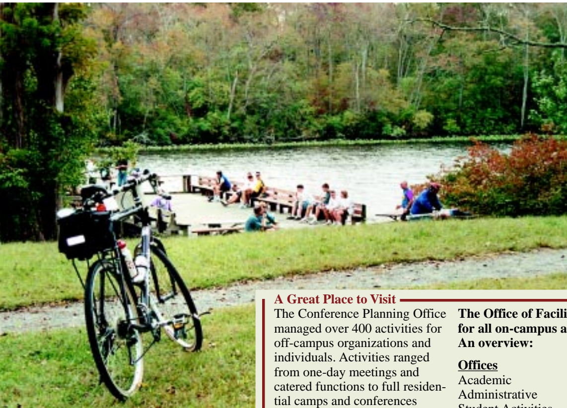
Some 7,000 participants enjoy the Eastern Shore during Sea Gull Century