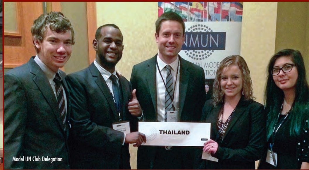
Model UN Club Delegation