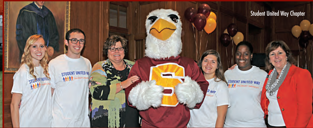
Student United Way Chapter