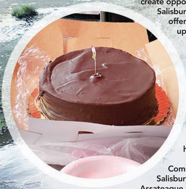
Psychology and Climate Change students were treated to Smith Island cake on their class field trip.